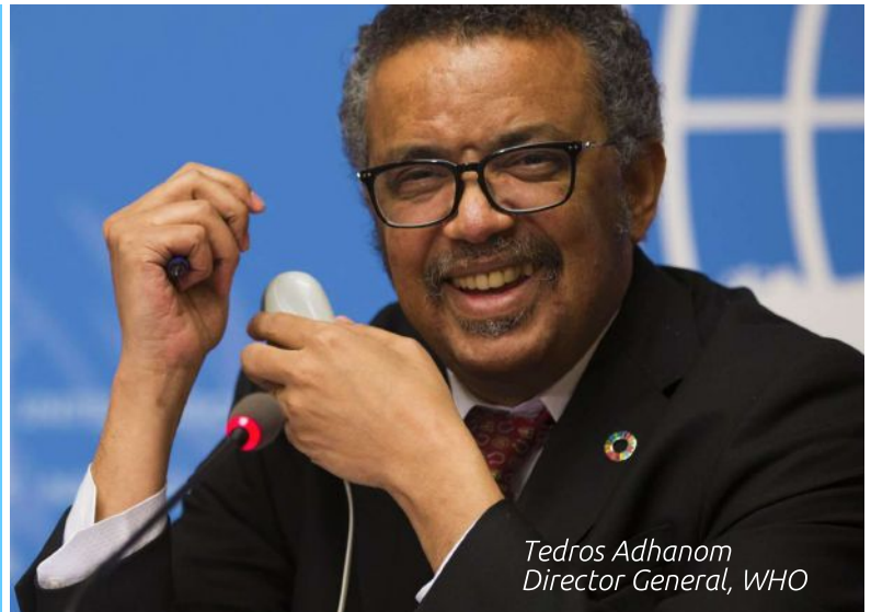
Tedros Adhanom Director General, WHO

The World Health Organisation Director General Tedros Adhanom has rightly stated that countries fighting the coronavirus should “Test, Test, Test”. As we have argued in our primer on Covid-19 Testing in the UK, moving towards mass testing is essential for both getting people the treatment they need now and for eventually easing lockdown measures and enabling people to get back to work. Weekly testing of whole populations would allow immediate quarantine of those infected and allow lockdowns to be gradually released. @ Tony Blair Institute for Global Change