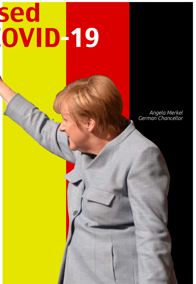
Angela Merkel German Chancellor

“The best path is one that is careful, and not taken light-heartedly.” source@shropshirestar