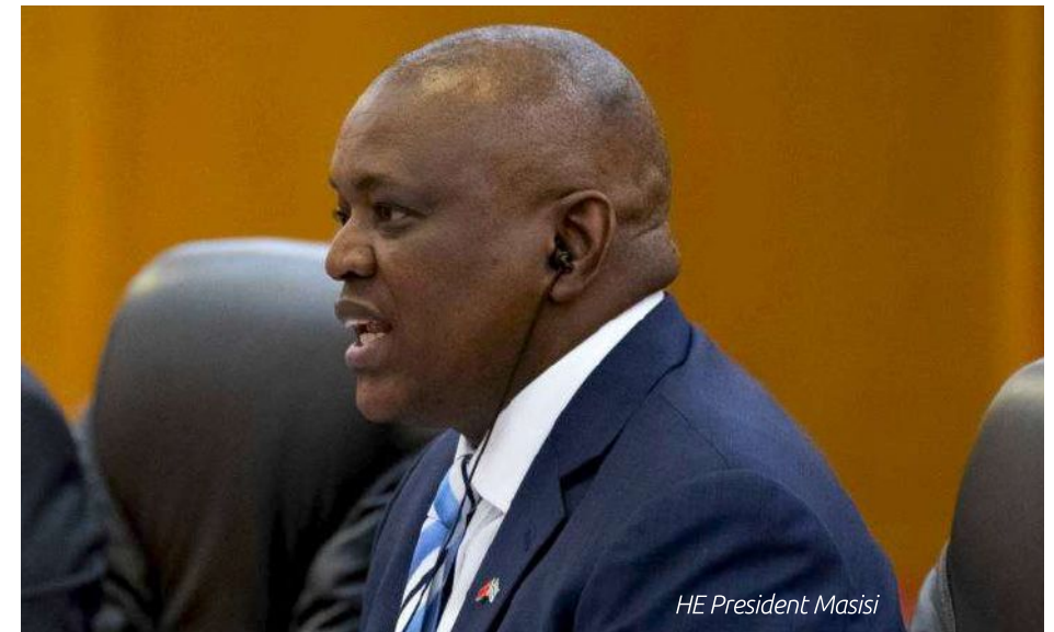
HE President Masisi

Botswana is focused on health promotion to contain the virus and ensure that it does not take root in the communities.