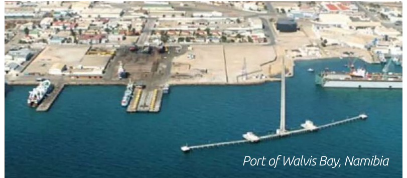
Port of Walvis Bay, Namibia

He explained that while the country needed to keep regional borders open, it was important for regional leaders to agree on reasonable restrictions as well.