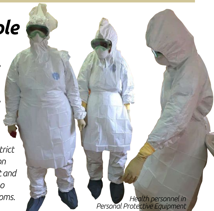
Health personnel in Personal Protective Equipment