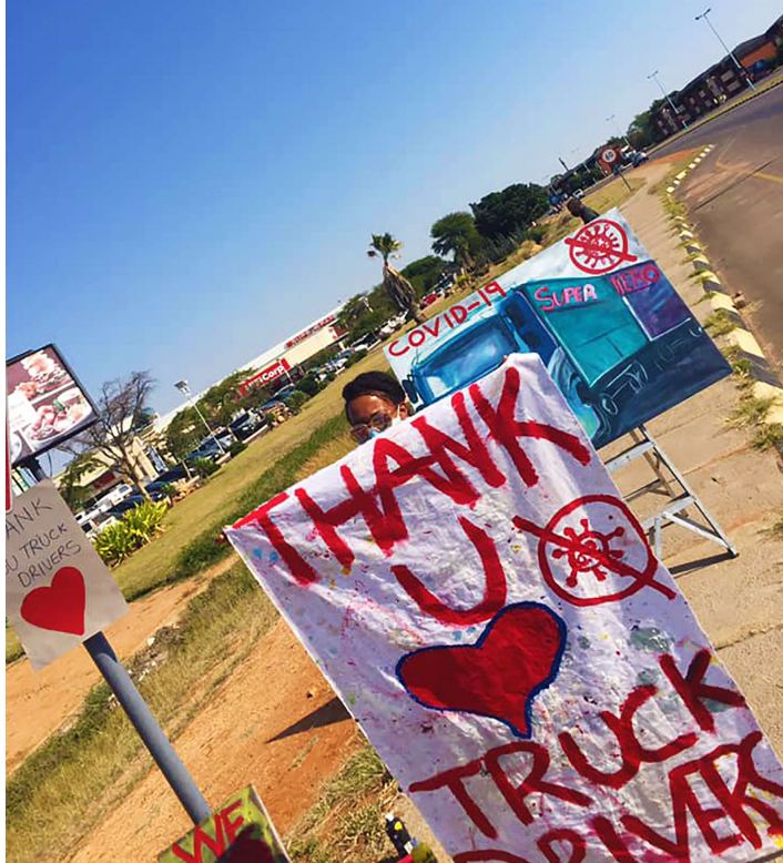
A group of friends in Gaborone appreciating truck drivers