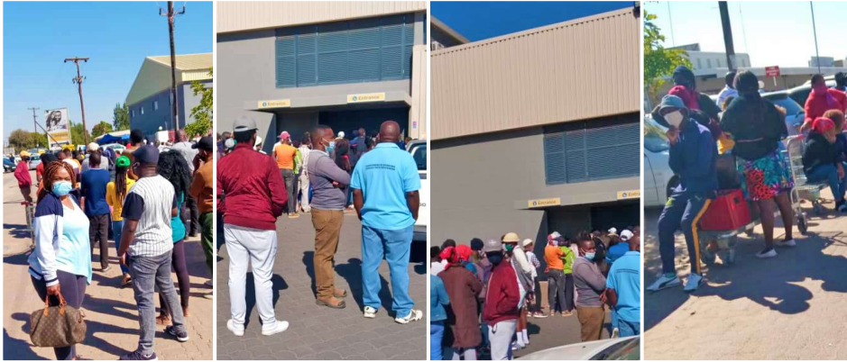
Some Batswana in Gaborone queuing at a liquor outlet yesterday

M ultitudes of elbow benders thronged Liquor outlets yesterday, contravening the social distancing protocols in the process as Botswana lifted a ban on alcohol which has lasted for two months.